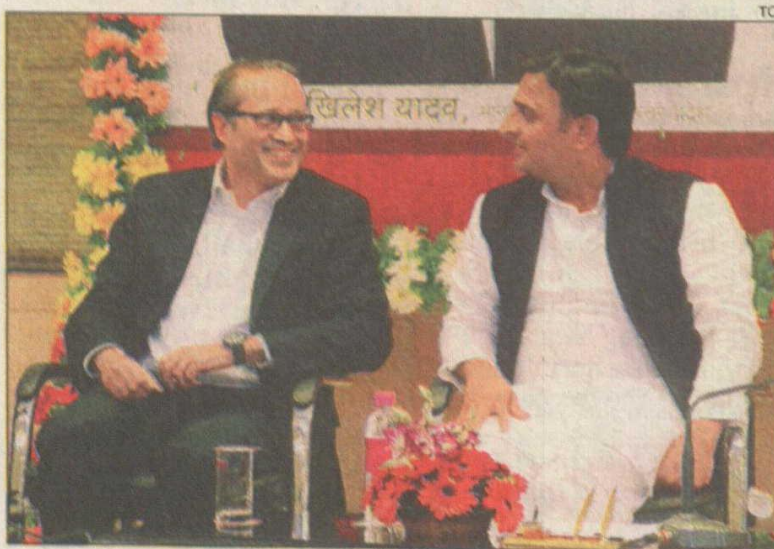
Times Group MD Vineet Jain with UP chief minister Akhilesh Yadav at a function in Lucknow on Thursday to announce the setting up of the university

Welcoming The Times Group's venture in UP, Akhilesh Yadav said, "I would like to thank Vineet Jain and The Times Group for choos-